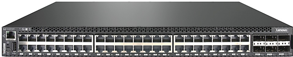
Figure 1. Lenovo ThinkSystem NE1072T RackSwitch

The Lenovo ThinkSystem NE1072T RackSwitch is shown in the following figure.